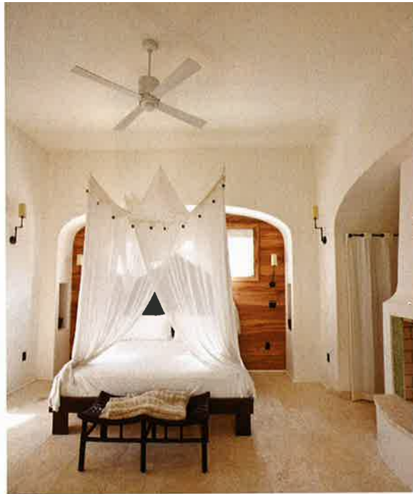
The master bedroom's Balinese mosquito netting is suspended with fishing line.